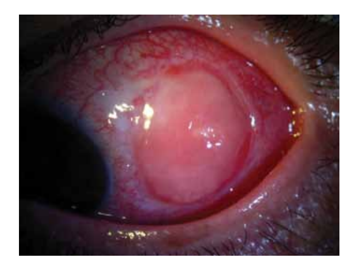
Fig. 3 - Postoperative conjunctival granuloma in a pterygium patient who underwent conjunctival autograft.

Earlier reports on the use of AM grafts for recurrent pterygia, either alone (15) or combined with autograft limbal transplantations (16), noted unsatisfactory results, with reported recurrence rates of 37.5% and 25%, respectively. This finding might be partly due to the aggressiveness of the